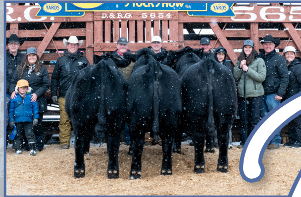
Grand Champion Percentage Pen of Three Bulls Foster Bros Farms - Lockney, TX