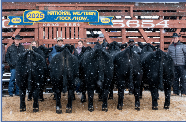
Grand Champion Purebred Pen of Five Bulls Schaake Farms, Inc - Westmoreland, KS