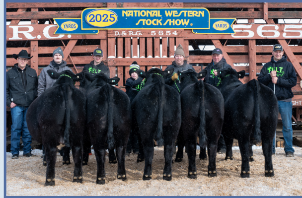
Grand Champion Percentage Pen of Five Bulls Felt Farms - Wakefield, NE