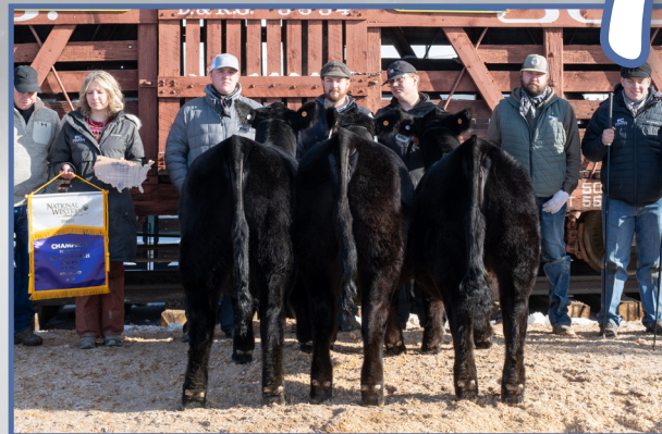
Grand Champion Percentage Pen of Heifers Freking Cattle - Alpha, MN