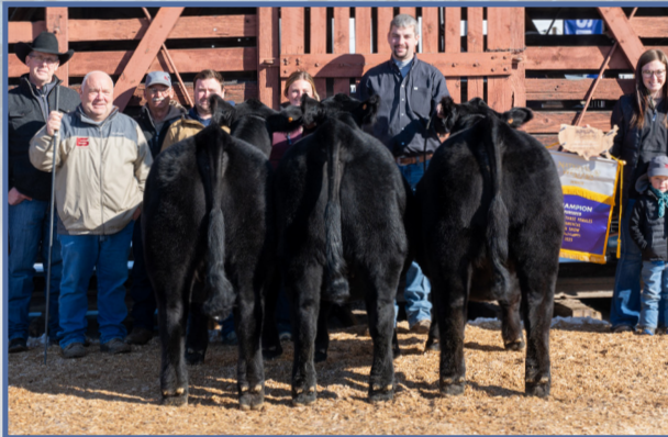
Grand Champion Purebred Pen of Heifers Long's Simmentals - Creston, IA