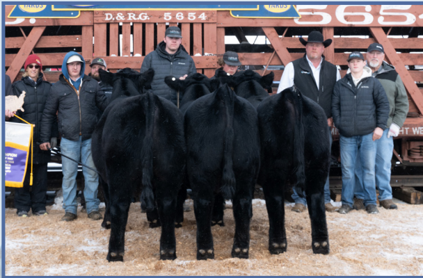
Grand Champion Purebred Pen of Three Bulls Freking Cattle - Alpha, MN