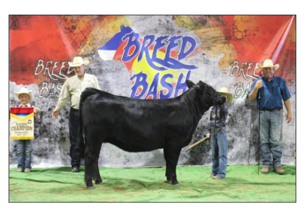
CJSA offers defrayment funds to qualifying members.

At left: Blake's pair as Supreme Simmental Female. At right: Easton's Reserve Supreme Simmental.