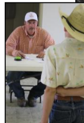
CJSA members are shown following the 2023 annual meeting in Brush. The 2024 annual CJSA meeting will be June 1.