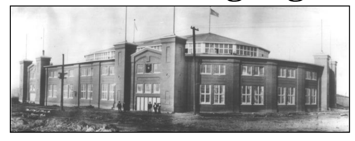
The Stadium Arena in 1908.

All shows start at 9 a.m. The updated schedule is: